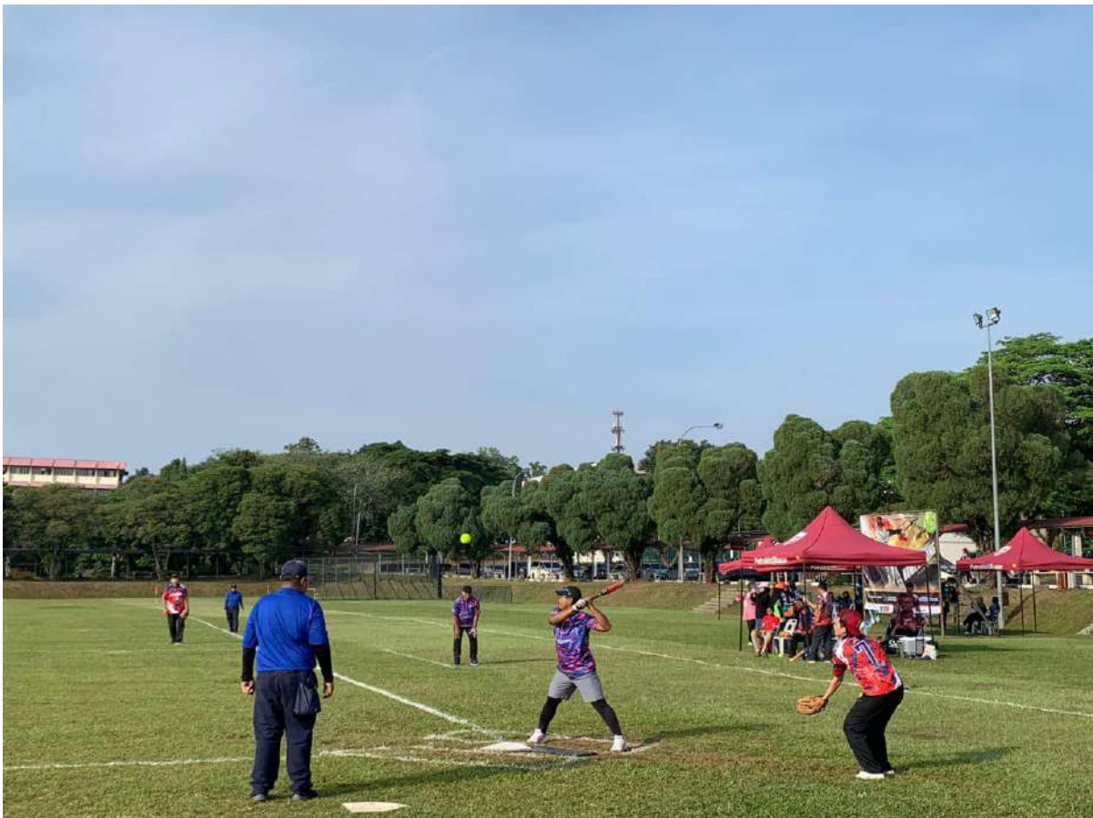
Alumni Slow Pitch Homecoming 2024